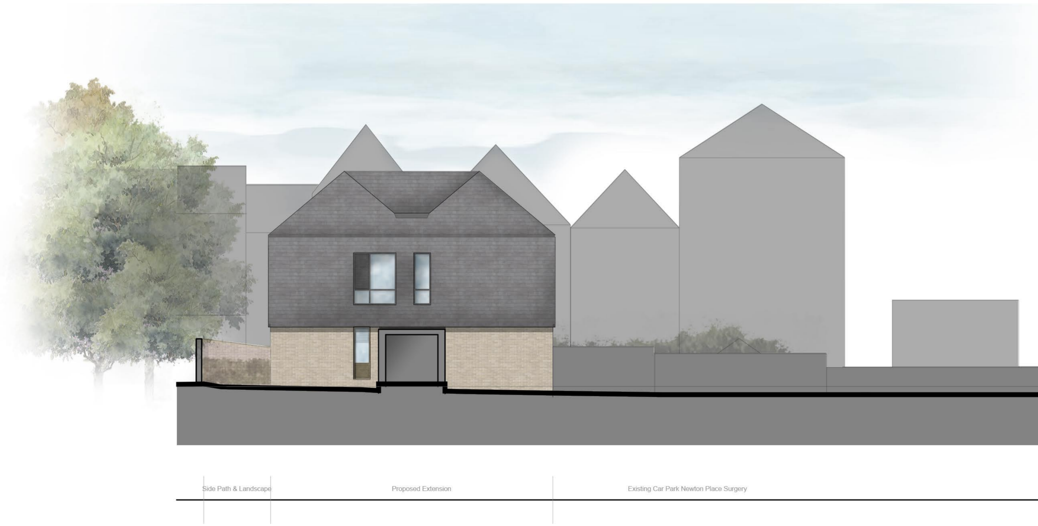
South-East Elevation Section Plan as Proposed 1:100